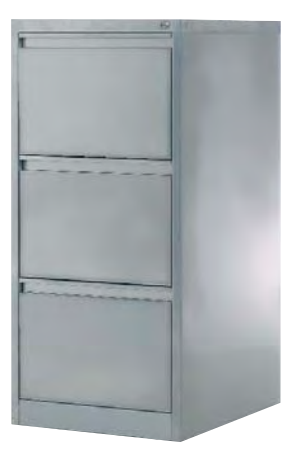
Two and Three Drawer Filing Cabinets