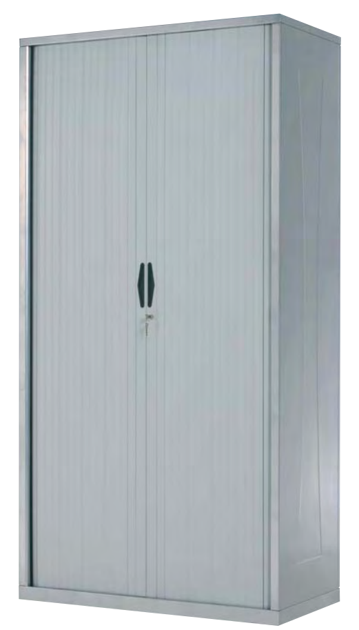
1950mm High Tambour Door

Side tambour doors feature a unique design which with the key removed allows the handles to be fully retracted, to give a clear open storage of 900mm in a 1000mm cabinet. While the additional handle fitted onto the rear fascia allows the blind to be easily closed again.