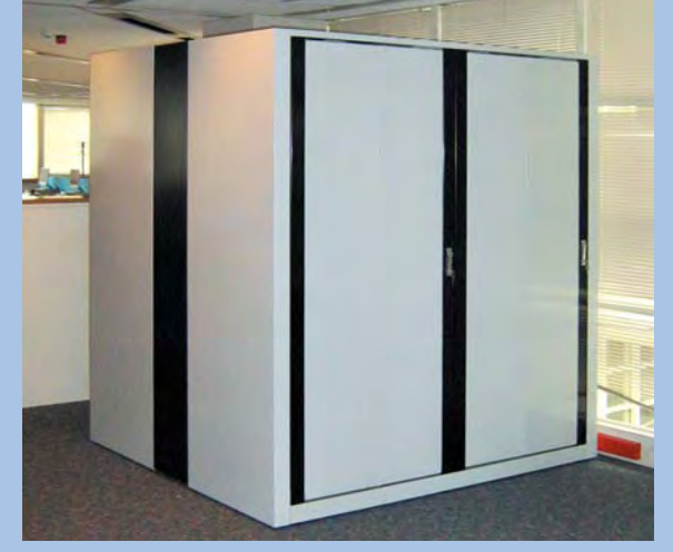
Cabinets can be grouped together to create filing blocks