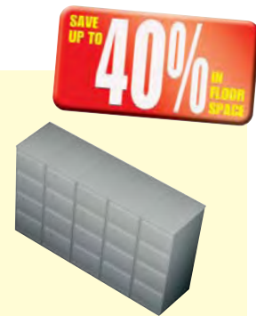
The contents of 5 four drawer filing cabinets can be accommodated in one rotary cabinet.

* Depth required when rotating cabinet is1131mm Standard (SpeedRange) Cabinet size